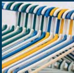
Second hand uniform sales