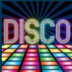
Early Years disco Years 1 - 4 disco