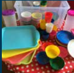
Eco party packs £5 per pack