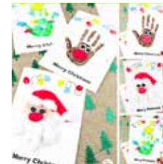
Children's Christmas cards